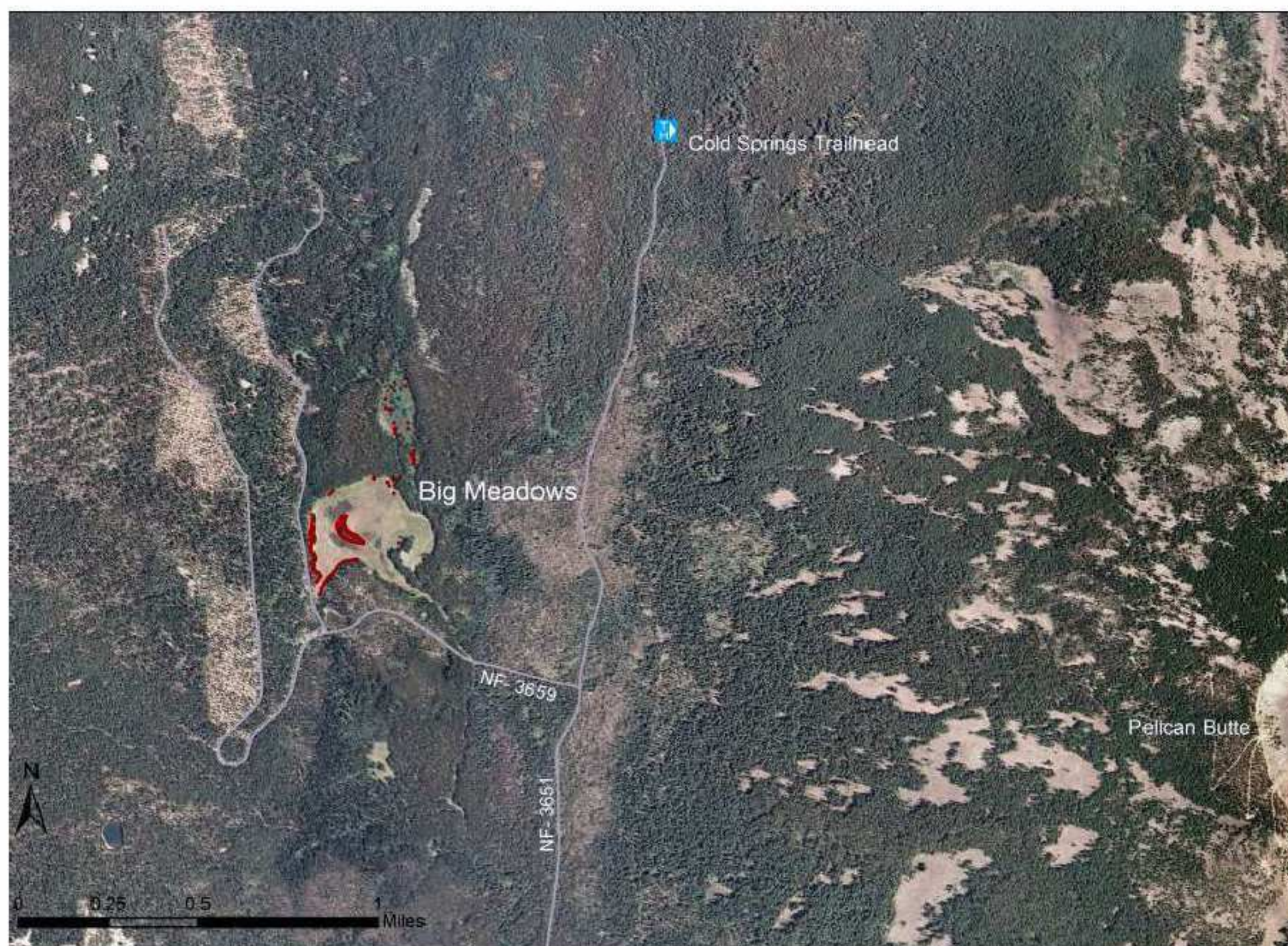
Figure 5. Aerial photo showing mapped occurrences of Castilleja collegiorum , marked in red, within the Big Meadows complex.